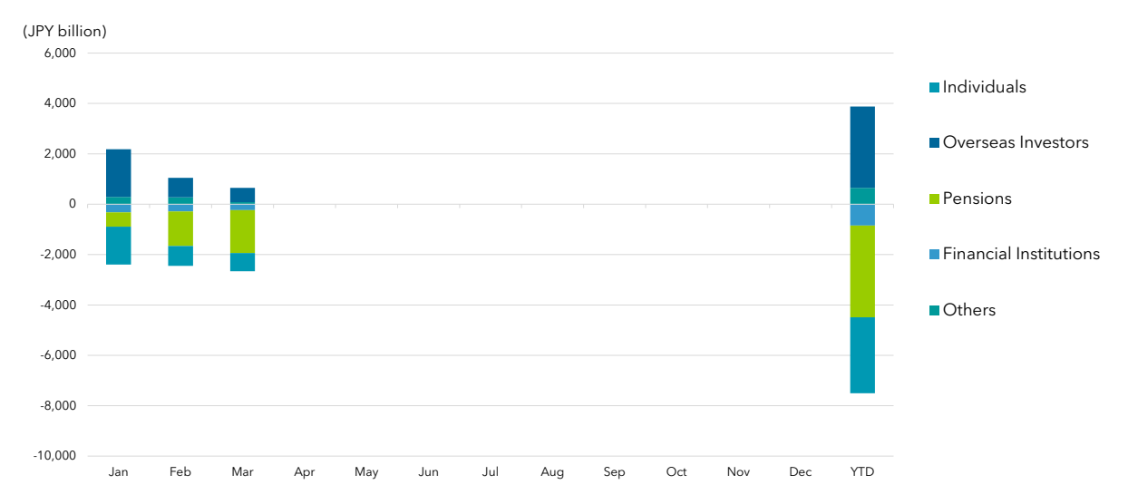
FIGURE 6. MONTHLY INVESTMENT ACTIVITIES BY INVESTOR TYPE IN THE JAPANESE EQUITY MARKET**