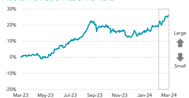
FIGURE 4. LARGE-SMALL CAP SPREAD

Note: The spread between the Russell/Nomura Large Cap Index and the Small Cap Index (Positive figure means Large Cap dominant)