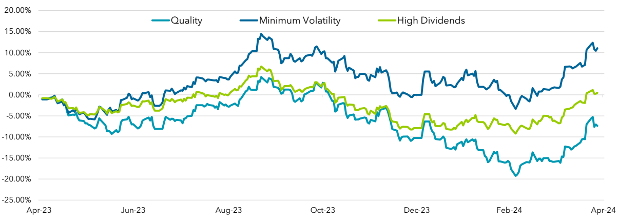
FIGURE 5. MSCI JAPAN FACTOR INDEXES SPREAD AGAINST MSCI JAPAN*

Note: The spread between the Russell/Nomura Large Cap Index and the Small Cap Index (Positive figure means Large Cap dominant)