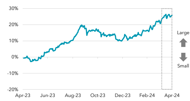
FIGURE 4. LARGE-SMALL CAP SPREAD

Note: The spread between the Russell/Nomura Large Cap Index and the Small Cap Index (Positive figure means Large Cap dominant)